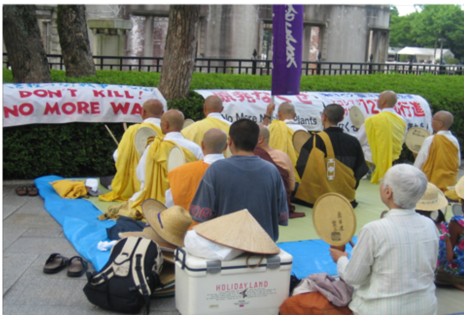
Prayers in front of the Atomic Bomb Dome