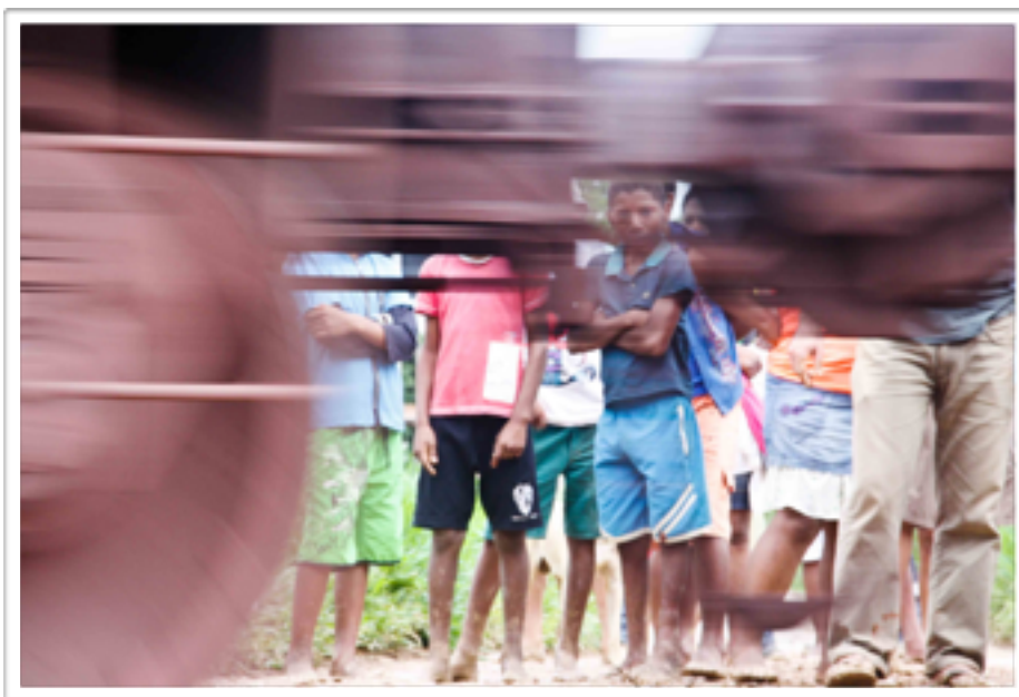
A Young Boy Watches a Passing Coal Train along the Path of the Proposed Rail Duplication

VIVAT members, witnessing these injustices, mobilized to speak out against the government actions. After verifying the facts and communicating with individuals on the ground, VIVAT drafted a response letter.