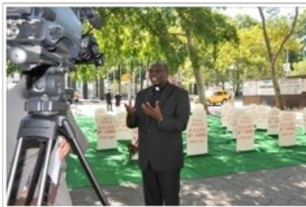
Apostle of Jesus Priest from Uganda, being interviewed during a Control Arms stunt at ATT in Dag H. Square