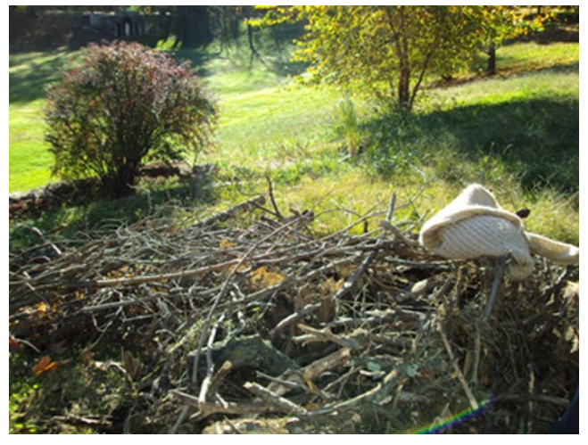
Gathered materials which will mimic the forest floor.