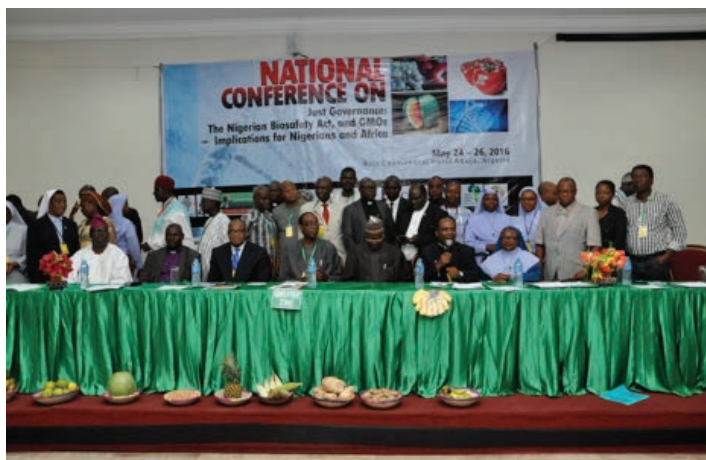
A cross section of participants at the conference

In recent months, the Africa Faith & Justice Network (AFJN) has mobilized many organizations to join forces and address a great challenge facing African communities: the threat of takeover of their land, seeds and water sources. Corporations with deep pockets are grabbing large chunks of land across Africa for pennies, displacing local communities, genetically modifying and taking ownership of communally owned seeds, and using up and polluting the water supply. Some communities face the danger of losing their crop diversity and ecological system to single genetically modified (GMO) plants from these corporations.