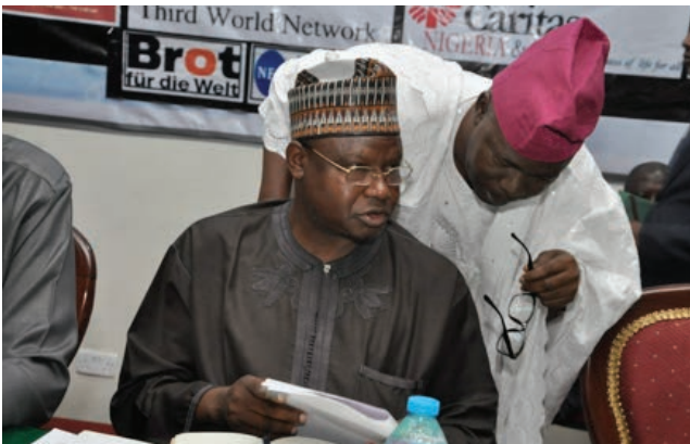
Nigeria's Minister of State for the Environment (seated) with the Director General of the National Biosafety Management Agency

that there is a fundamental problem besetting African countries. It is the problem of governance, manifested in the signing of Nigeria's Biosafety Act. Those entrusted with leadership regularly fail to work for the common good and welfare of their citizens. Rather than invest in the necessary infrastructure that supports local initiatives and ensure equitable distribution of state resources, many African leaders eagerly import and embrace ready-made solutions from abroad. They then impose these on their communities. The result is a systematic strangling and destruction of local development initiatives and the economy. This creates a dependent mentality within the community making them believe that salvation always lies abroad.