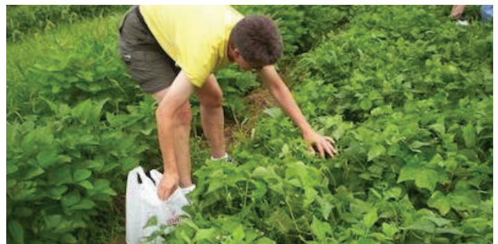
Harvesting greens at La Vista