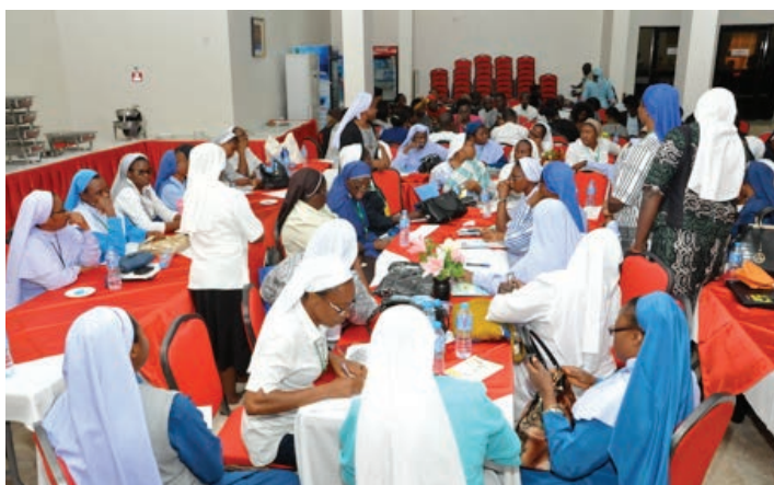
A cross section of women religious at the conference