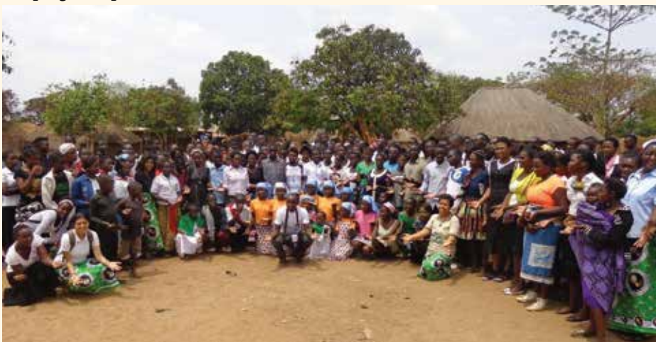
Mongu Diocese youth meet with local refugees