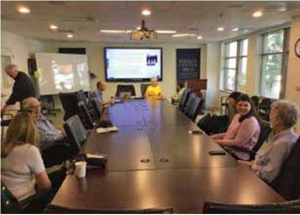
Faith and Money panel discussion at Berkley Center