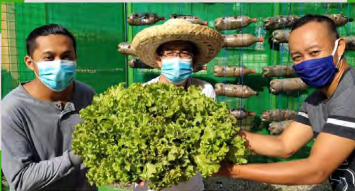
PROJECT GRACE, an Initiative addressing hunger & Oblate response to the UN Sustainable Development Goals was launched at The Shrine of Our Lady of Grace, Manila, Philippines

In this publication we are taking advantage of work that has been prepared by VIVAT International, “Eco LIFE and Action” and the various steps for action they have suggested. The Missionary Oblates are associate members of VIVAT and participate actively in a number of their common projects. Vivat's website: www.vivatinternational.org