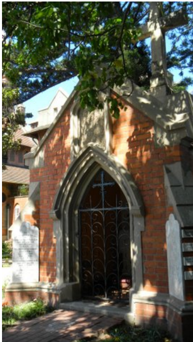
Chapel marking the graves of Oblates

http://emmanuelcathedral.org.za/category/projects/