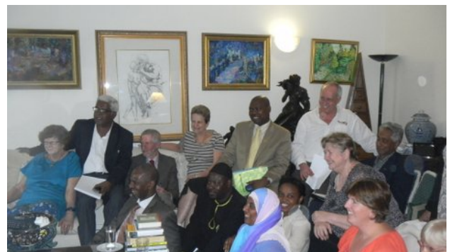
Meeting of Premier of Kwazulu-Natal and religious leaders